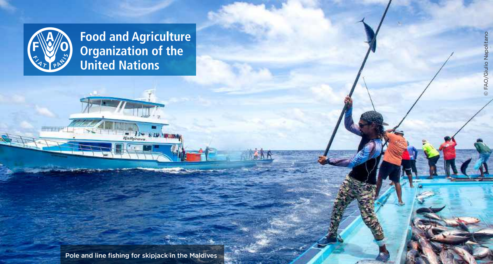
Pole and line fishing for skipjack in the Maldives

Food and Agriculture Organization of the United Nations