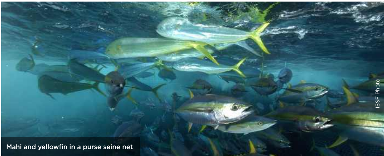
Mahi and yellowfin in a purse seine net

The bottom line is that stock assessments provide a limited basis for decision-making in an uncertain system with conflicting data sources. MSE, on the other hand, enables the selection of an MP that managers can be confident will achieve their objectives into the future. An MP is all about long-term planning for efficient and results-driven management, which is why MPs are replacing the traditional approach in both international and domestic fisheries worldwide.